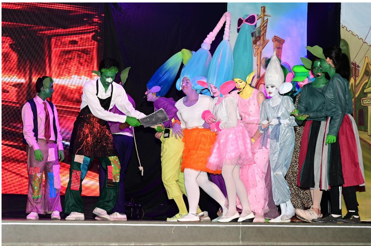
'ITS TIME FOR TROLLSTICE. UMM... TASTY TROLLS.'