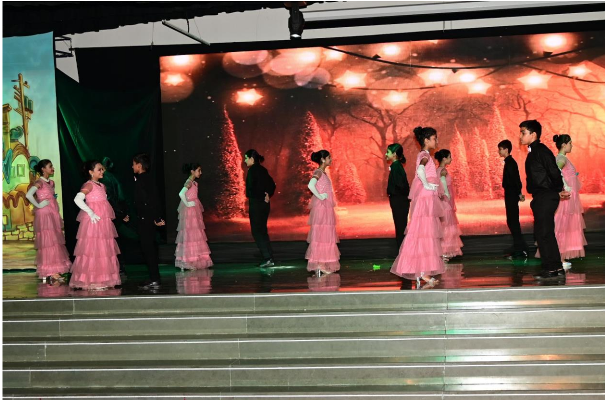
A MESSAGE FOR THE LOVERS OF THE NIGHT – 'LET ME START BY SAYING- I LOVE YOU.'