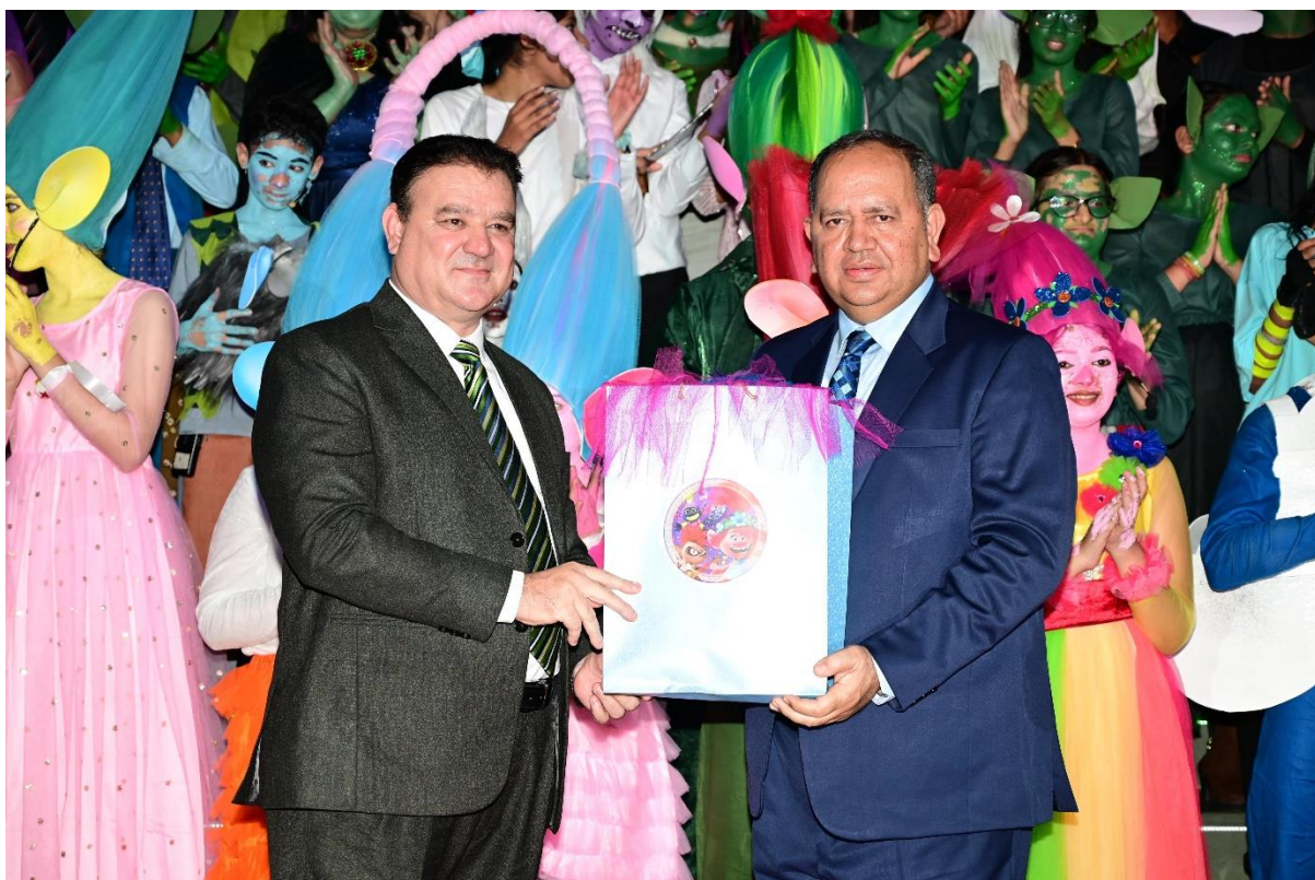
THE PRINCIPAL AND THE HEADMASTER SHARE A LIGHT MOMENT EXCHANGING SOUVENIRS.