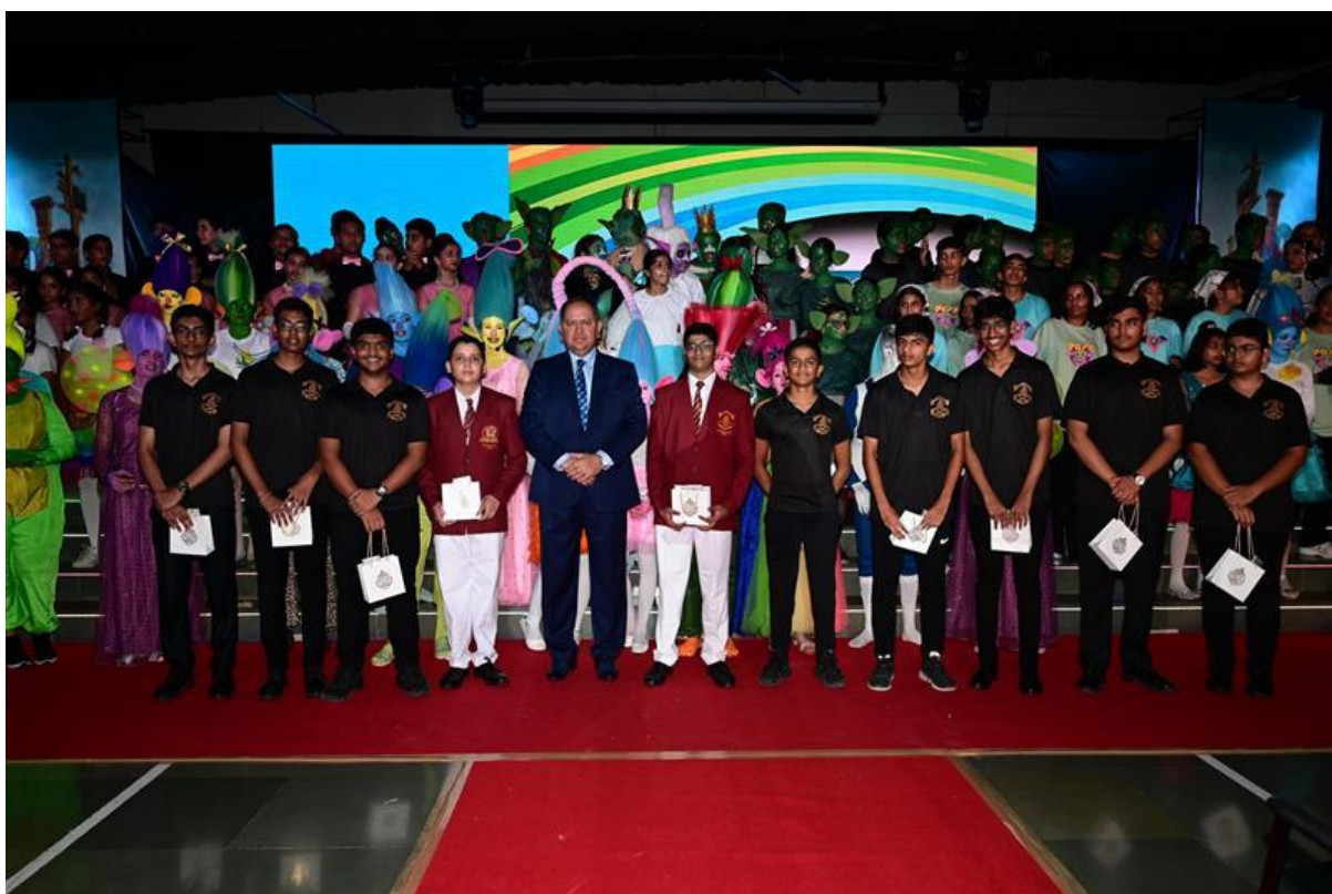
THE PRINCIPAL CONGRATULATING THE PARTICIPANTS AS THE DAY IS OVER.