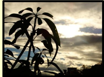
Photographs clicked by VARAD SARODE (CLASS - 10A)