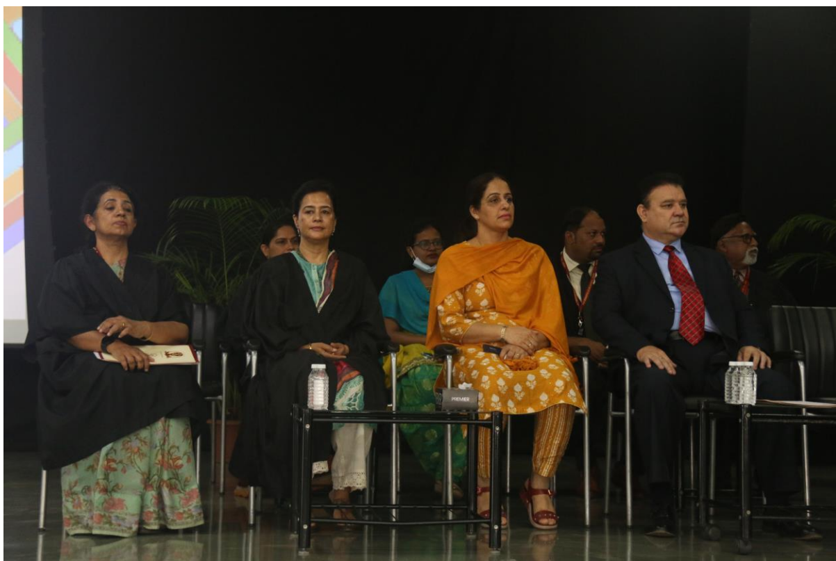
The Pillars of Education!