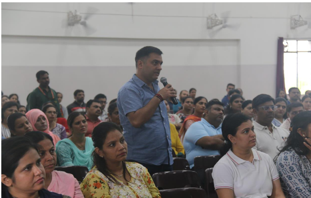
The question-answer session: Achieving excellence together!