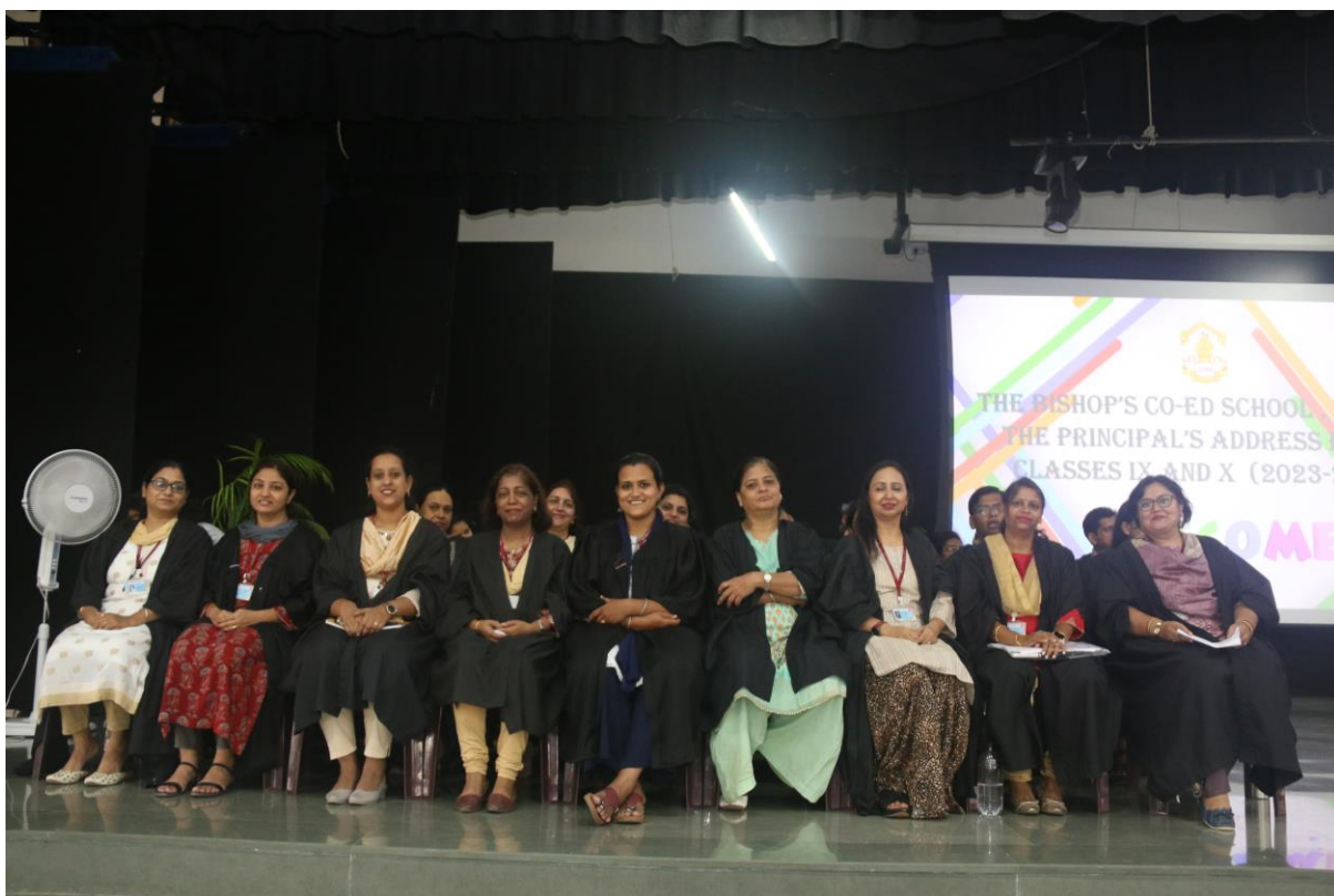
Teachers of classes 9 and 10: Wisdom Forever!