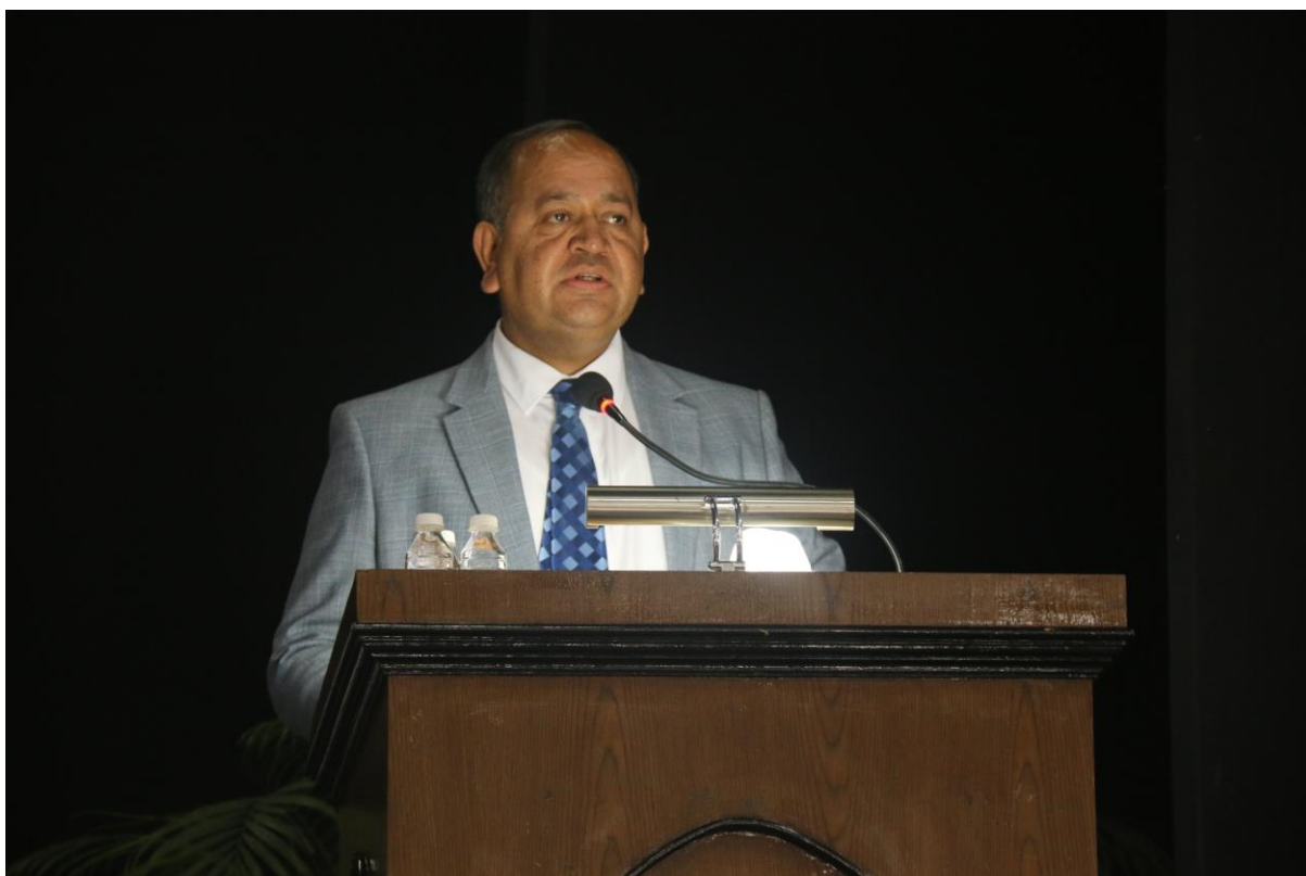
The Principal addressing the gathering: A Vision with Action!