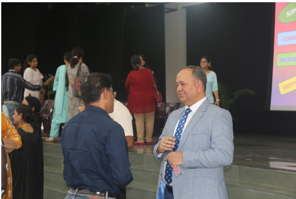
Parents and teachers interactive session: 'Catering to the needs'