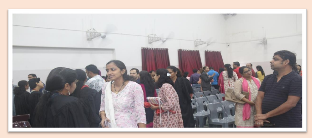
Parent Teacher Interaction-Together we can achieve