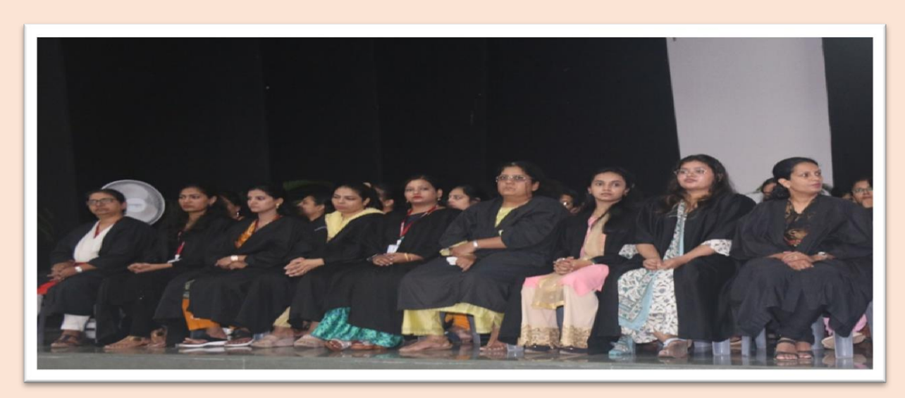
Teachers -All geared up in shaping the children's future