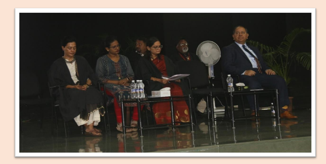
Heads of various departments