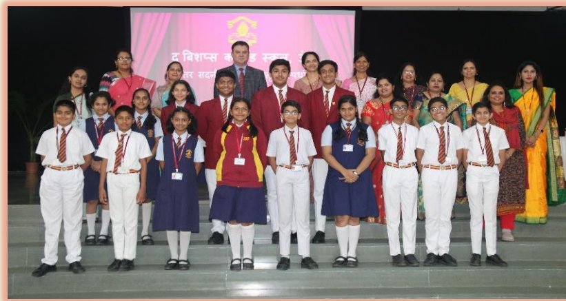
THE PARTICIPANTS ALONG WITH THE HARDWORKING TEACHERS