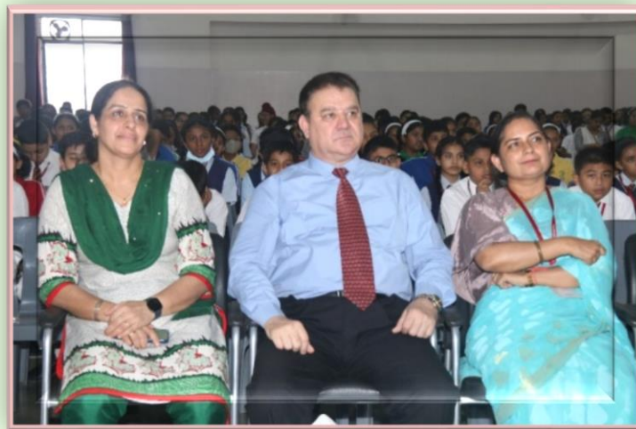
THE ENCOURAGING HEADS OF OUR SCHOOL