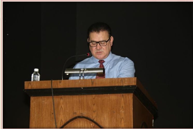
OUR ESTEEMED HEADMASTER