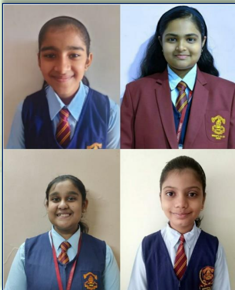
COMPARERS OF THE EVENT