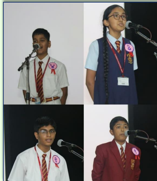
THE BEST ELOCUTIONIST