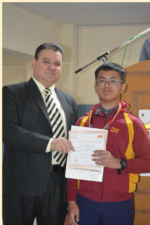
OUR HEADMASTER FELICITATING THE STUDENTS OF CLASS VII