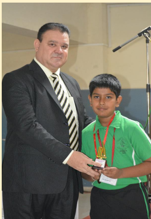
OUR HEADMASTER FELICITATING THE STUDENTS OF CLASS VI