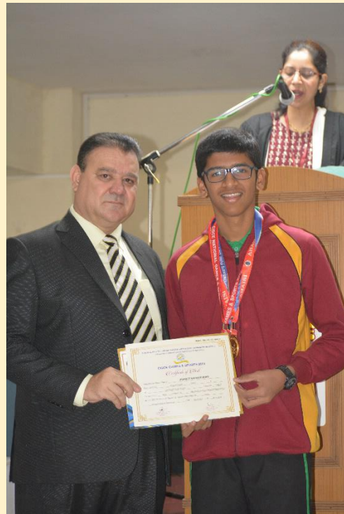
OUR HEADMASTER FELICITATING THE STUDENTS OF CLASS VIII