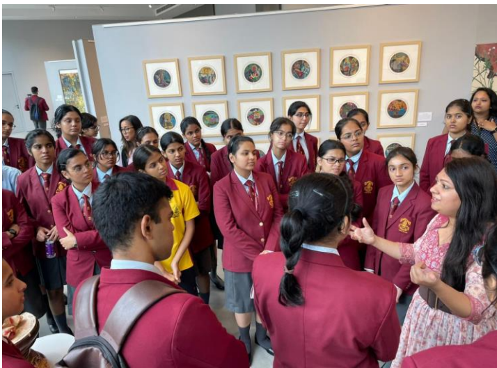
graced by the presence of one of the artists herself.

On account of Teacher's Day, Jindal Global University invited schools from all over Pune to explore various forms of applied art, mainly the Arts and Humanities streams. The students were welcomed into the gallery, after which they were free to explore and interpret the artworks.