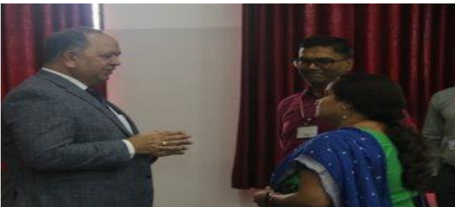
Achieving excellence together