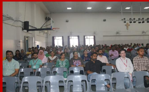
Parent-teacher interaction-An important tool for bonding