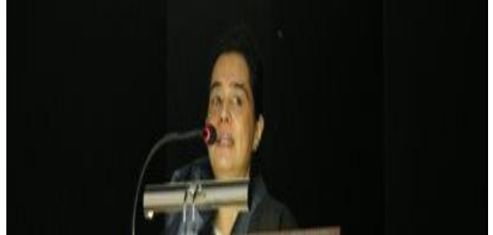
Making lives Better