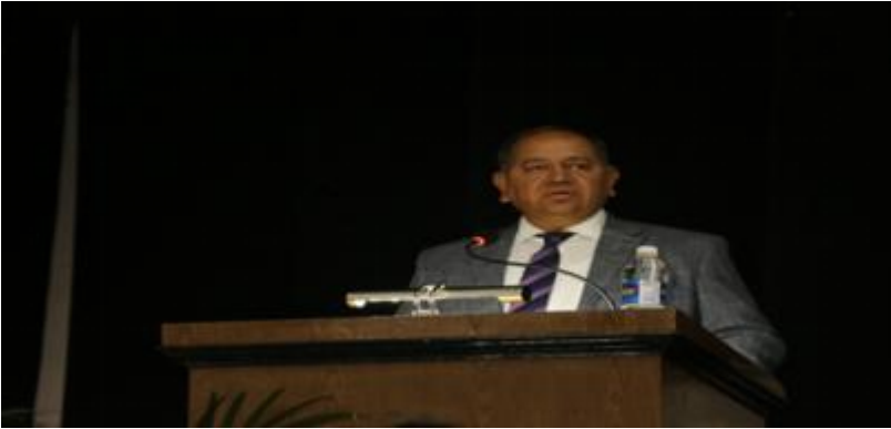
A Principal who leads the way to a brighter tomorrow