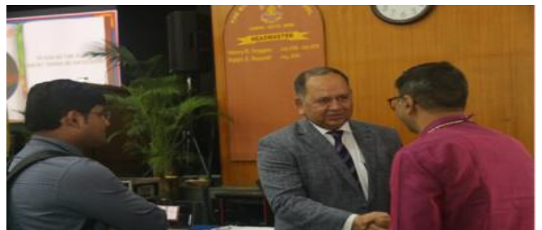
A pleasant handshake