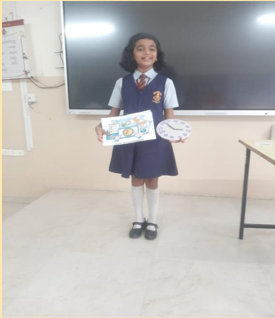
TIME IS PRECIOUS