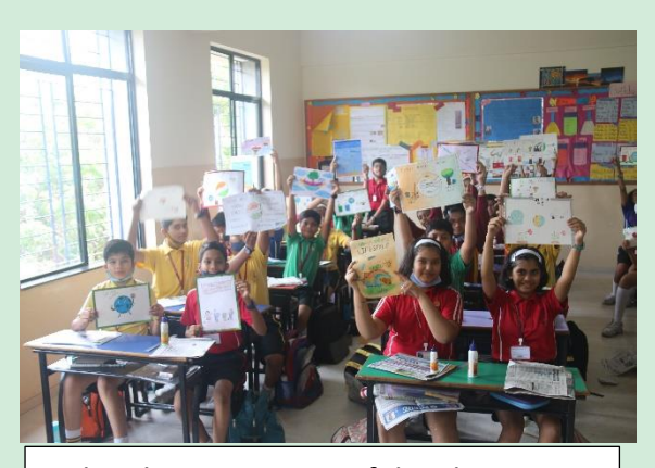
Cleanliness is a sign of development.