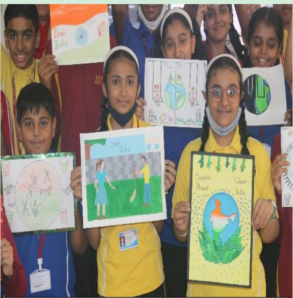
Make Earth greener.