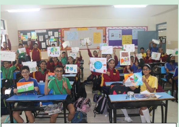
Keep Our Earth green and clean.