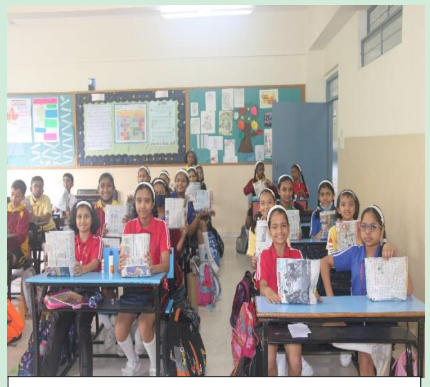
Say no to plastic bags.