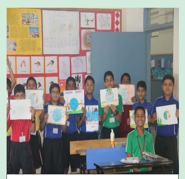
Stride for a cleaner and greener nation.