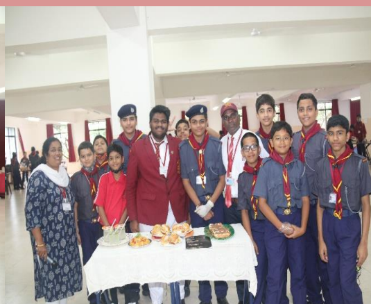
THE WINNERS - PATROL 3 (GUIDES)