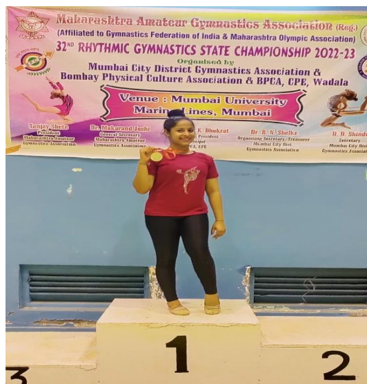
THE RHYTHMIC GYMNAST