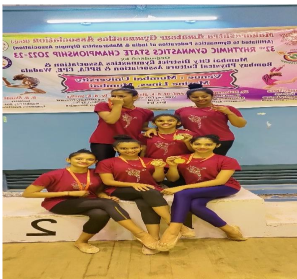
The Winners of the State Level group event