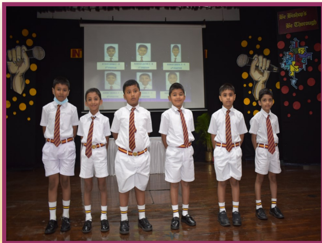
CLASS 2 PARTICIPANTS