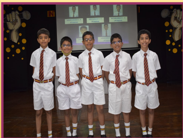
CLASS 4 PARTICIPANTS