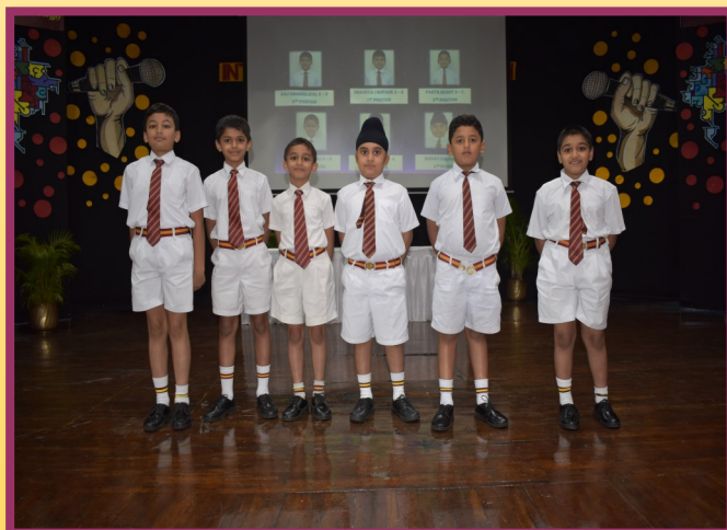
CLASS 3 PARTICIPANTS