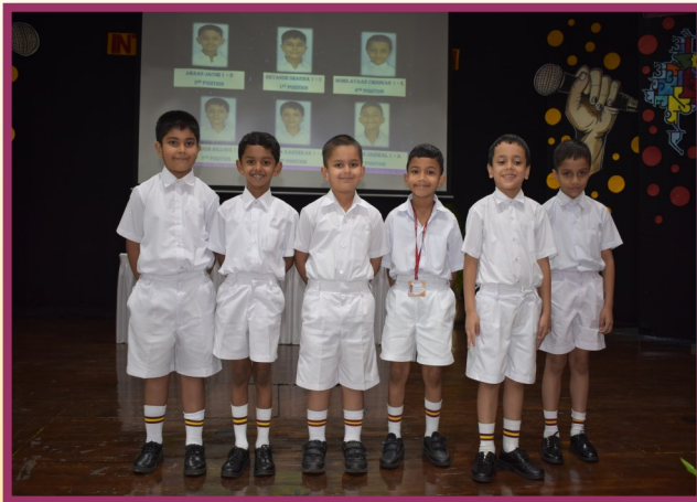
CLASS 1 PARTICIPANTS