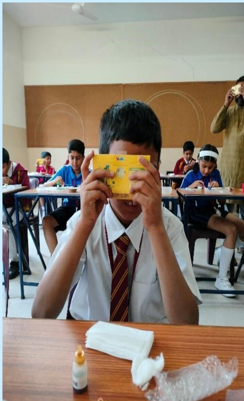
TRYING THEIR HAND AT STUDYING AN ONION CELL