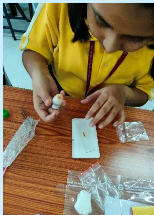
ADDING A DROP OF IODINE