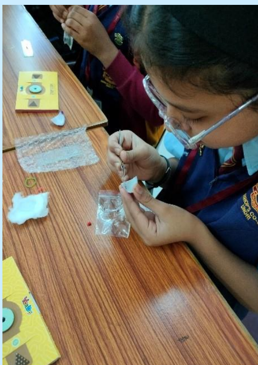
REMOVING AN ONION PEEL