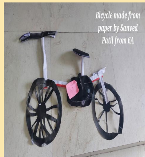
Bicycle made from paper by Sanved Patil from 6A