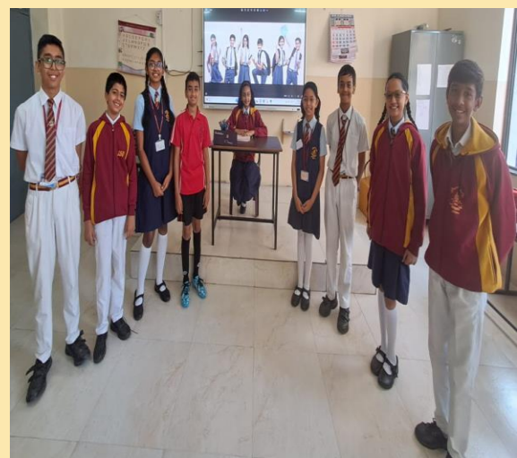
'STUDENTS GET INTO TROUBLE FOR FIGHTING' CLASS 6 D