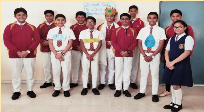
'CONSERVE TODAY FOR A BETTER TOMORROW' CLASS 8 H