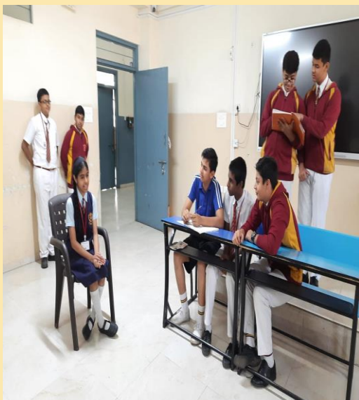
'IMPORTANCE OF TIME'