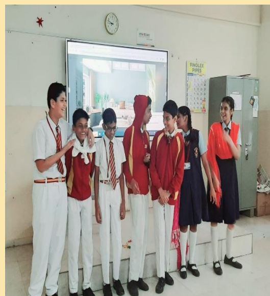
'DOSTI'- CLASS 8 D