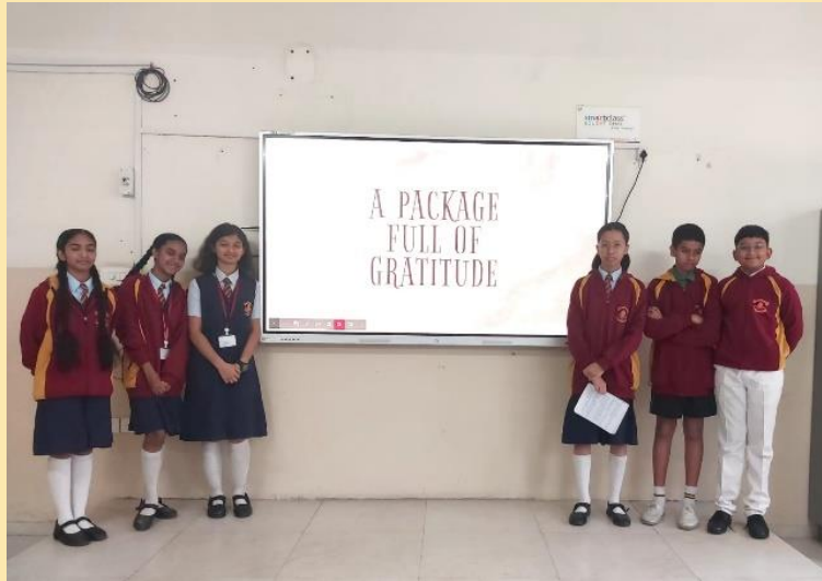
'A PACKAGE FULL OF GRATITUDE'- CLASS 8 A