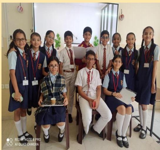
'AWARENESS ON THE ILL EFFECTS OF INCREASED SCREEN TIME' CLASS 6 C