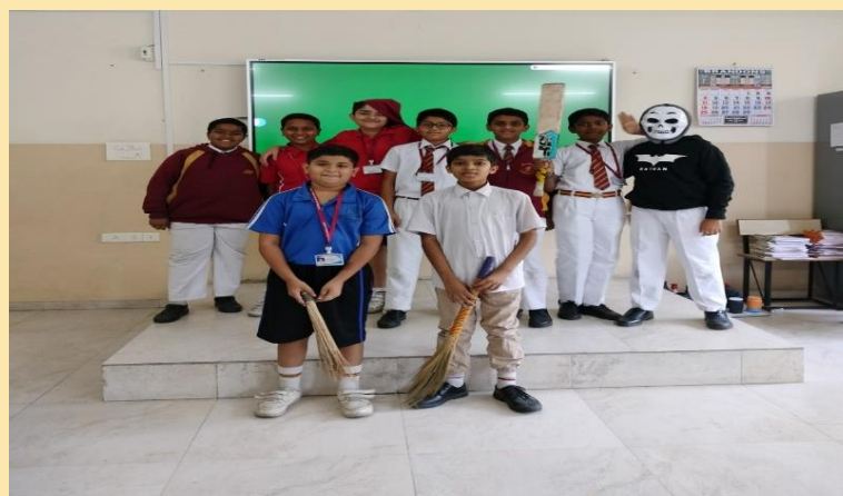
'ALL ABOUT WASTE'- CLASS 6 I (HINDI)