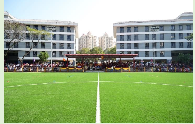
THE NEWLY LAID FOOTBALL TURF