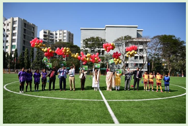
DIGNITARIES RELEASING THE BALLOONS