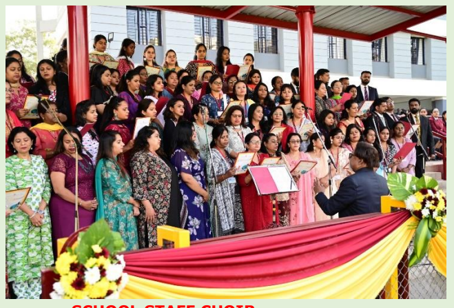
SCHOOL STAFF CHOIR