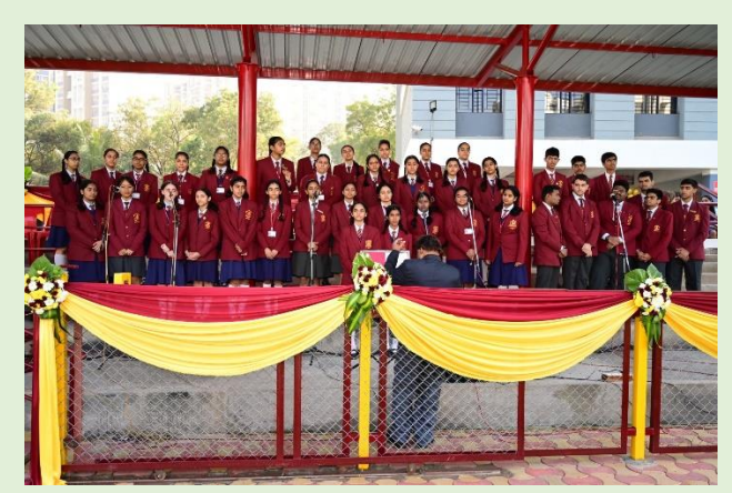
SCHOOL STUDENT'S CHOIR