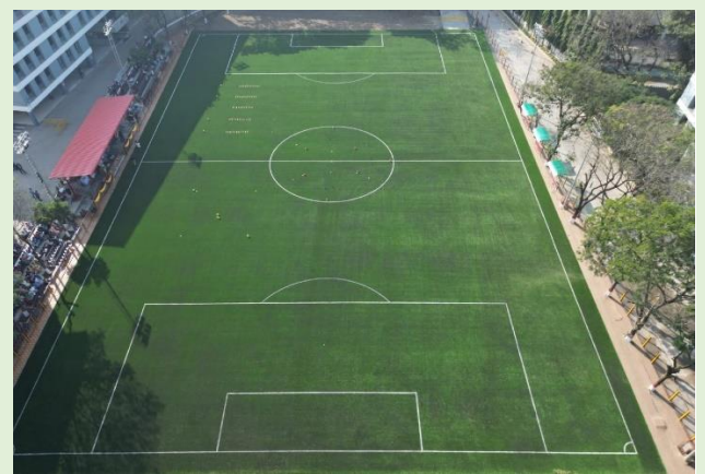
ARIEL VIEW OF THE FOOTBALL TURF