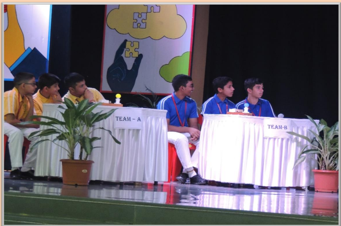
The teams waiting patiently after the prayer.