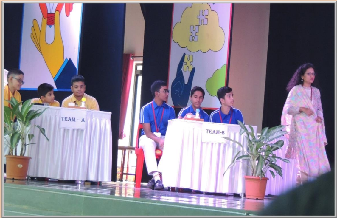
TEAM 'A' and TEAM 'B'