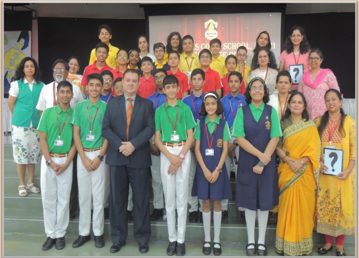
Our Enthusiastic Participants