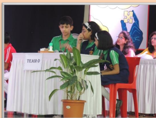
Team 'D' engrossed in discussion before giving the answer.